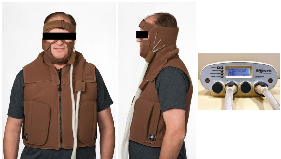
FIGURE 1 Flexitouch system for head and neck [Color figure can be viewed at wileyonlinelibrary.com ]

Tactile Medical routinely asks all patients who are prescribed a Flexitouch system to complete a pretreatment survey during their at-home device training visit and to complete the same survey approximately 1 month after starting treatment. This survey is designed to assess the effects of APCD treatment on symptom control and functional complaints commonly experienced by patients with HNL, including patient-perceived changes in ability to control lymphedema through at-home treatment, ability to perform daily activities, level of head and neck pain or discomfort, and difficulty in swallowing or breathing. 15,16 The survey includes five questions asking patients to rate their symptoms using a Likert scale from