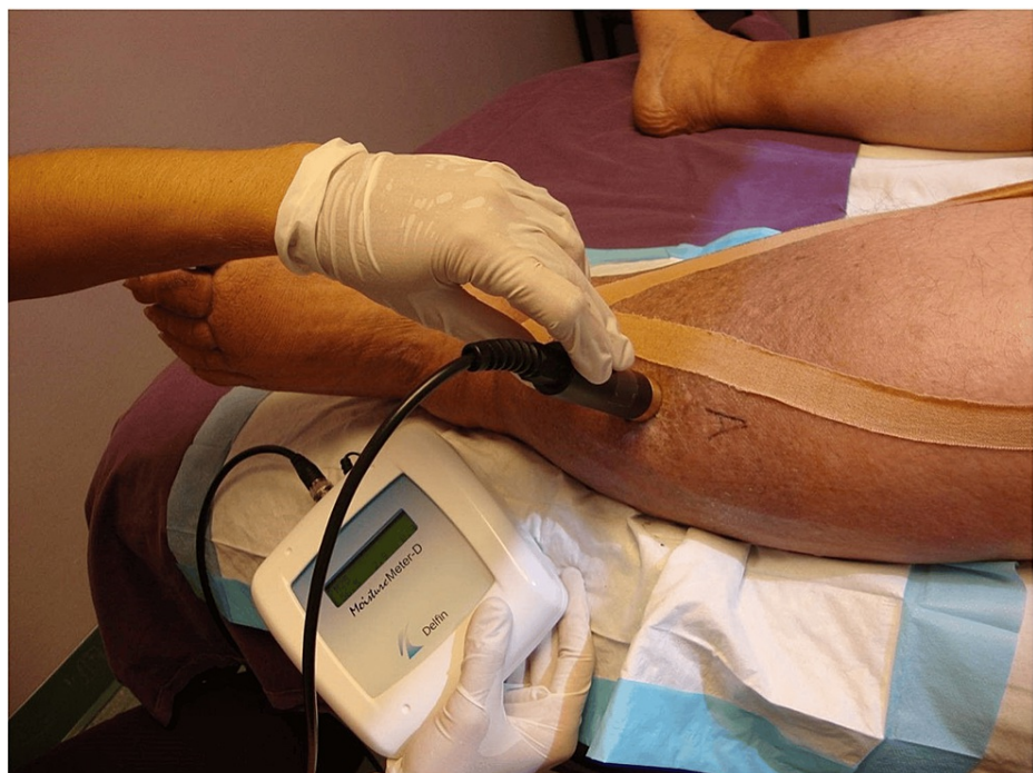
FIGURE 2: Tissue dielectric constant: lower extremity measurement illustration

TDC measurements are useful for diagnosing and evaluating lymphedema and edema in the lower extremities, providing a practical, cost-effective, and reliable method for assessing treatment efficacy, differentiating between various pathologies, and evaluating skin properties in patients with diabetes mellitus. Figure 2 illustrates its use in a patient.