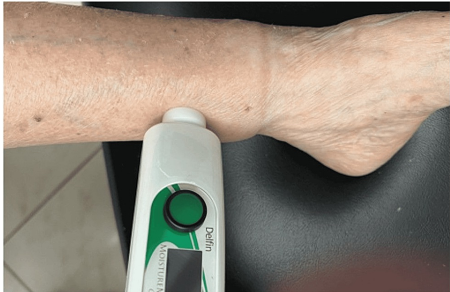
FIGURE 3: Application of compact device in lower extremity lymphedema

electromagnetic signal transmitted into the skin [36-38]. In one version (as shown in Figure 2), the probe is connected to a control box that generates a 300 MHz signal, which it then transmits through the skin via an open-ended coaxial transmission line [36]. A segment of the signal partly reflects back, enabling the calculation of the complex reflection coefficient, which is used to determine the dielectric constant, defined as the ratio of tissue permittivity to vacuum permittivity [37,40]. The measurement at the desired skin location tends to be done in triplicate, with the average value used. Known TDC values from ethanol-water mixtures are typically used for calibrating the probes [40]. An example of a measurement with the handheld compact device is shown in Figure 3.